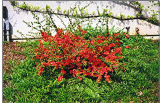
Common Flowering Quince in bloom

This is a high maintenance shrub that will require regular care and upkeep, and should only be pruned after flowering to avoid removing any of the current season's flowers. Gardeners should be aware of the following characteristic(s) that may warrant special consideration;